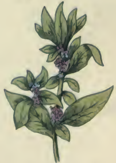
Petitory of the Wall.