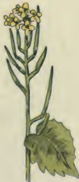
Jack by the Hedge.