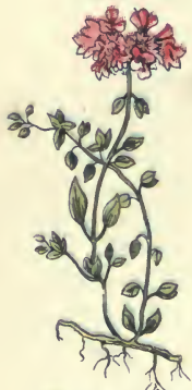
Mother of Thyme.