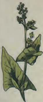
Good King Henry.