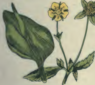
Adders Tongue. Urens.