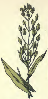
Gold of Pleasure.